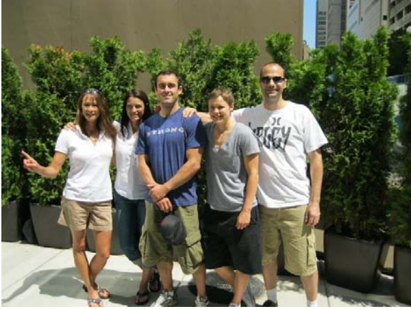
One more TT Team photo before we were off to the airport.