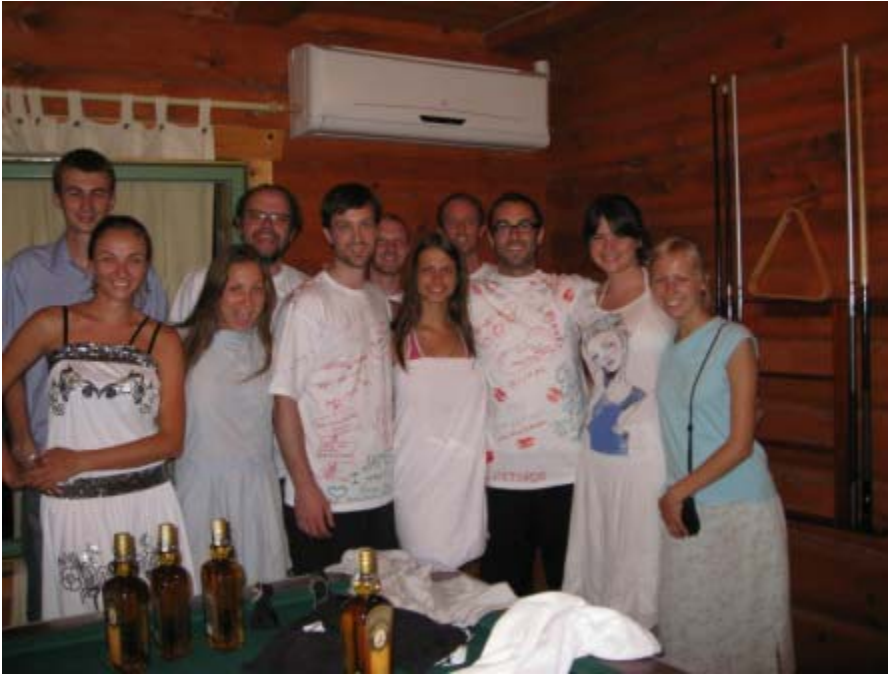
Some students and camp instructors at the surprise party.

10pm – After the presentation ceremony, everyone jumped in the giant sauna or hot tub, and then a group of us went down to the lake for some night-swimming.